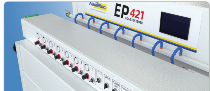
CNC Controller & Software