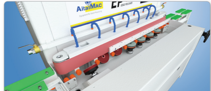
Multiply Edge Polisher