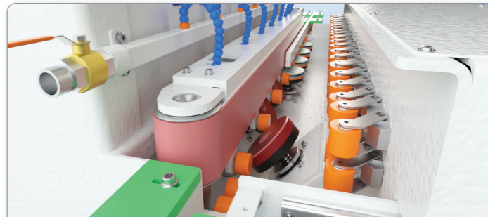
Vertical belt and pressure wheel